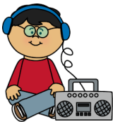
Listen to the radio