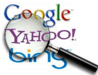
Search the net