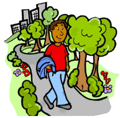
Walk in the park